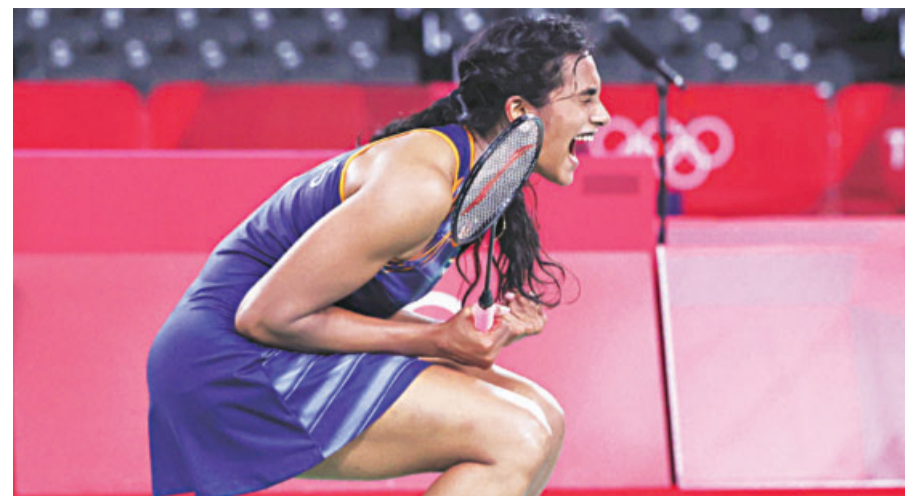
P V Sindhu reacts after her quarter-final win against Japan's Akane Yamaguchi on Friday.